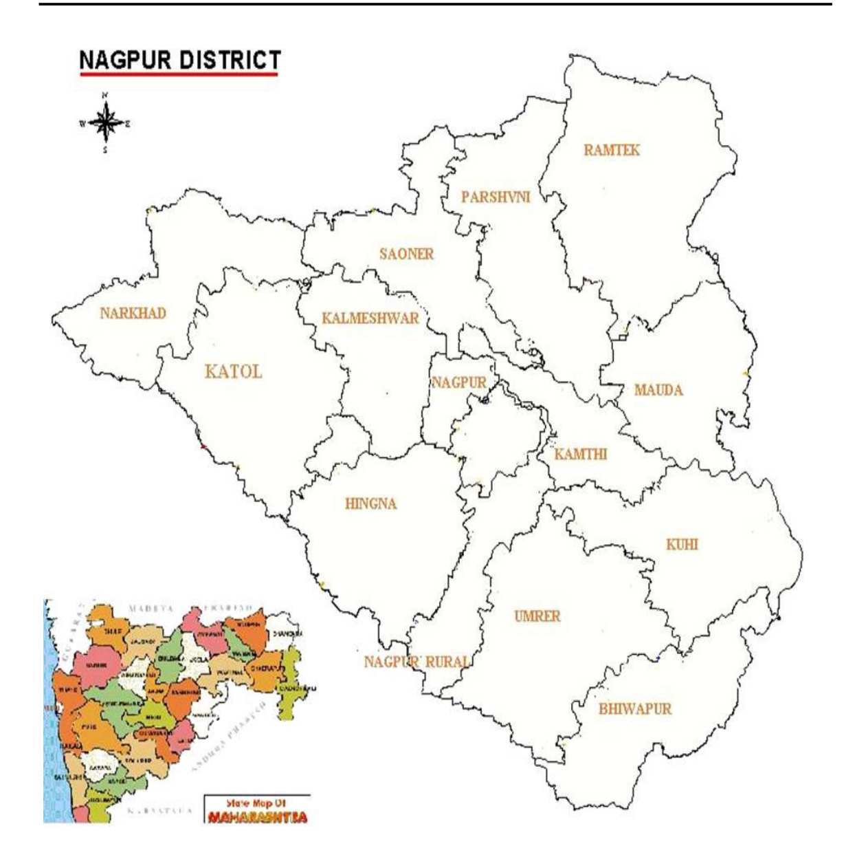
Figure 1. Map of Nagpur district showing Tahsils.